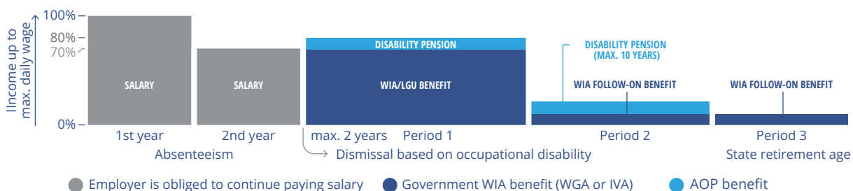
Outline of situation D – WGA up to legal maximum daily wage

If your situation remains unchanged, the benefit payment continues until you reach the state retirement age.